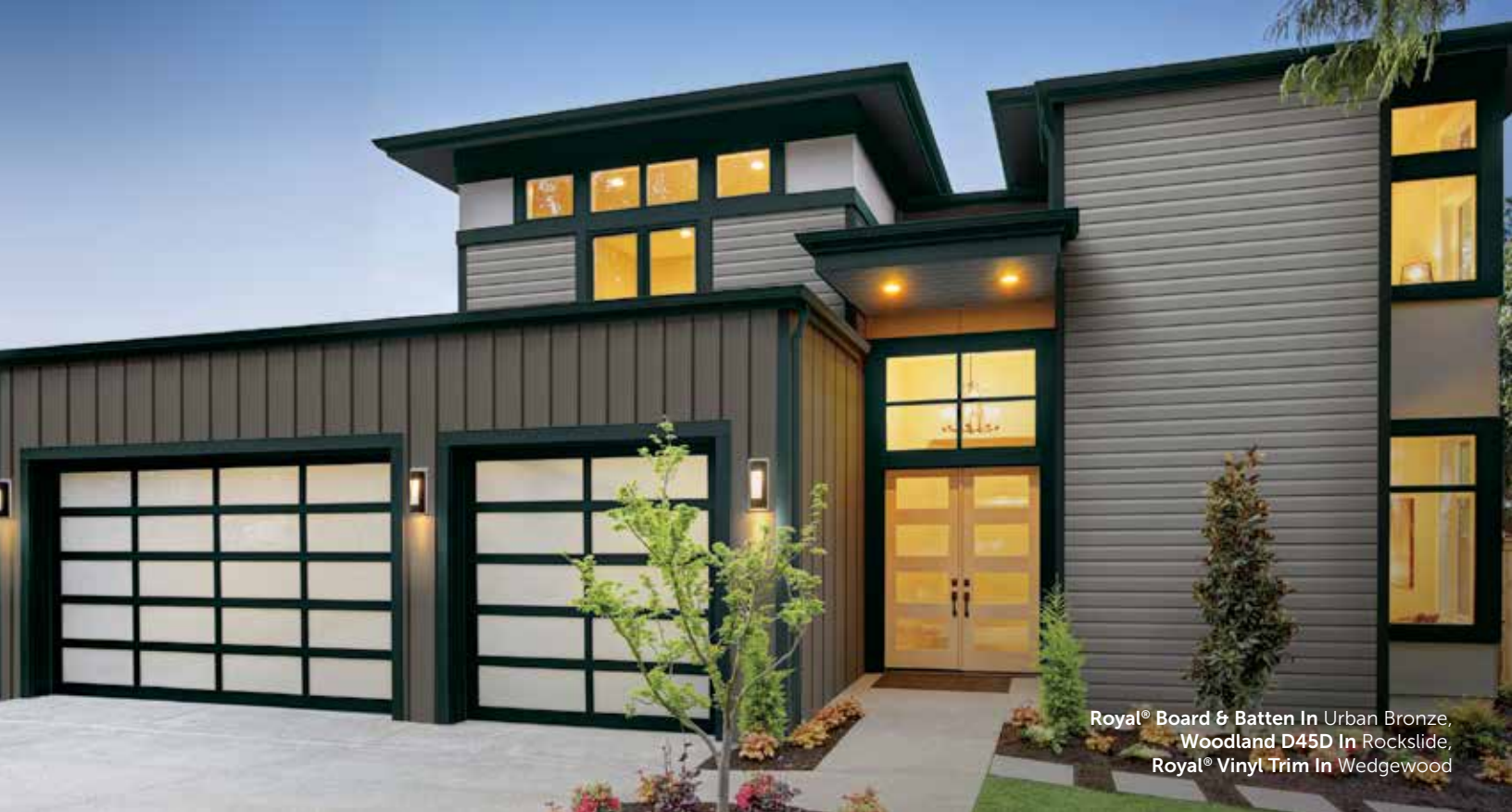
Royal® Board & Batten In Urban Bronze, Woodland D45D In Rockslide, Royal® Vinyl Trim In Wedgewood